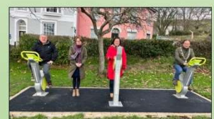
Launch of the 2 spin bikes and 1 hand bike installed in Cae Sgwar, Aberaeron on the 9 th January 2023

Email: claire.hamer@wales.nhs.uk Tel: 01970-628962 www.ruralhealthandcare.wales